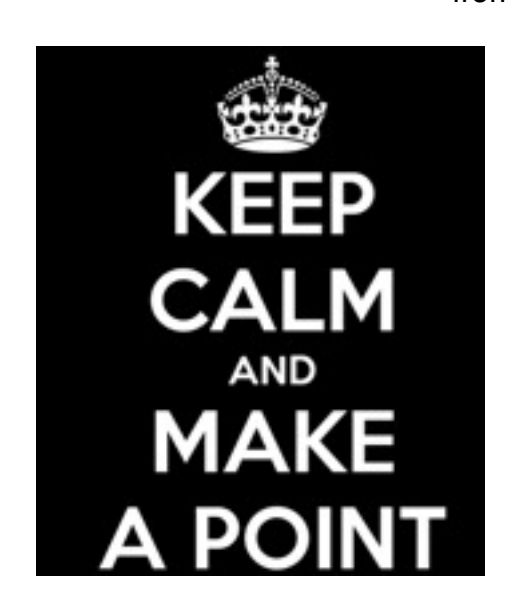
Analysis – Explain how this specific example helps to prove your thesis.

Specific example – This gives one specific example from the either text.